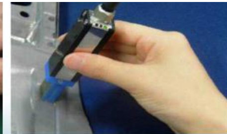
Fig 2. Standard and others